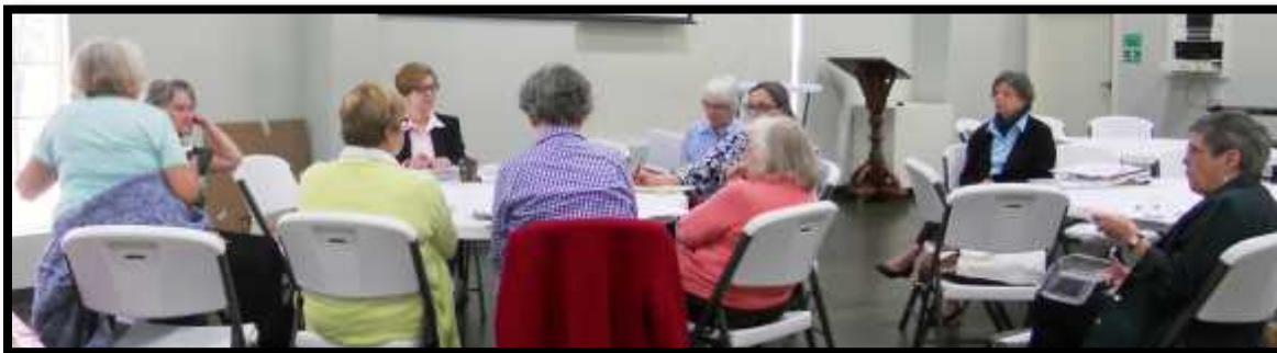
The CVWG Board meets monthly prior to the general meeting. Being a Board member is a great way to help direct the course of the Guild. It's also a way to make meaningful and lasting friendships with other art lovers.

Our library's little "headquarters" is a table set up at the monthly meetings, where the holdings are available for you to inspect. We have a register for attendees signing out and returning tapes. We don't have a lot of formal rules-- there is no requirement to "be quiet" like what many of us remember from the libraries in our school days, and I don't have my hair in a bun like those worn by stereotypical librarians! But do drop by to see our collection and chat. I really enjoy the job, always reminds me of how happy I was when I received my first library card as a young girl. See you at our next meeting!